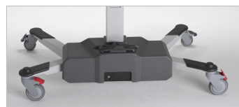
TR 3000 Battery operated - Back of chassis