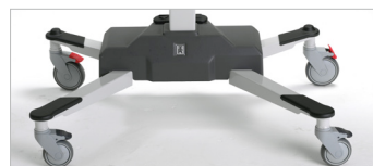
TR 2000 Hydraulic - High chassis and TR 3000 Battery operated - High chassis