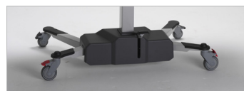
TR 2000 Hydraulic - Back of chassis