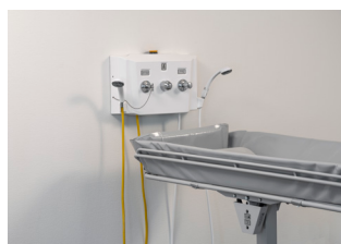
TR2000 with TR2810 Shower Panel