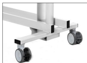
4" twin casters as standard. 2 broken and 2 straight steering.