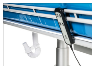
Hand control for height/tilt adjustment