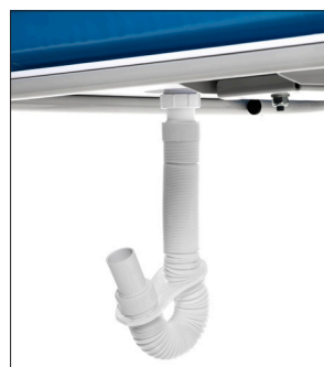
Flexible draining hose with hose holder