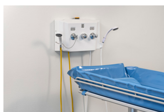
TR3200 with TR2810 Shower Panel