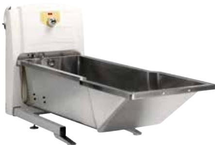
TR 900 Cleaning model

All TR 900 HiLo panels can be delivered with a Stainless Steel bathtub as an option. The Stainless Steel tub has the same functional design as the standard TR 900 glass fibre tub and is manufactured in high quality steel (EN 1.4301).