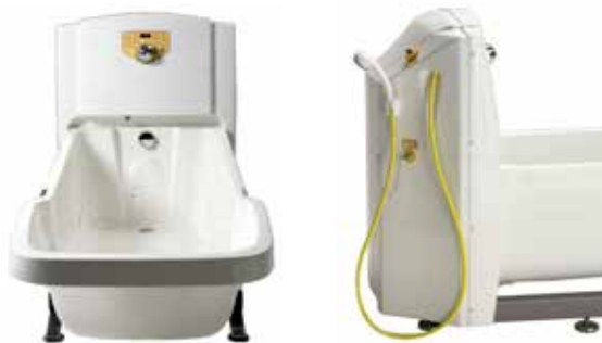
TR 900 Autofill model

Transport wheel beam and set of loading ramp Installation set TR 900, TR 900C/TR 900CW Head pillow Local treatment in combination with Whirlpool