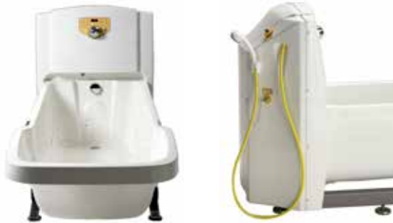
TR 900 Autofill model