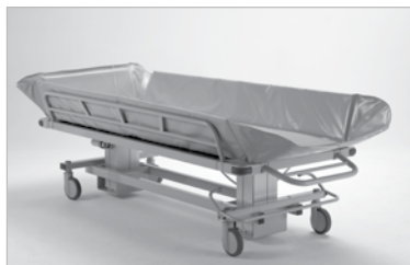
Head end rail folds to horizontal position for extra length.