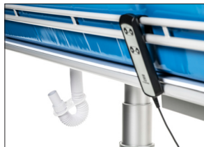
Hand control for height/tilt adjustment