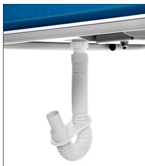
Flexible drainage hose with hose holder