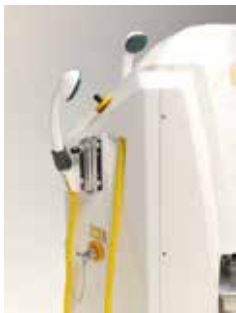
TR 900SS Cleaning model