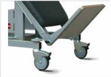
TR Classic has a wide foot plate, adjustable and lockable in three angle positions.