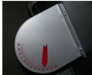
TR Classic effortlessly tilts from horizontal to a 90 degree upright position and has a tilt indicator for monitoring of angle.