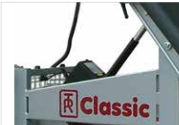
TR Classic Tilt Table is operated by an electrical actuator with battery back up for lowering in case of power failure.