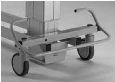
Convenient single foot control for straight steering and brakes.

Side rails swing down or lock in horizontal position for transfer and upright position for transport.