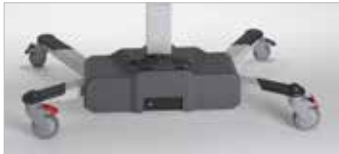
TR 3000 Battery operated - Back of chassis