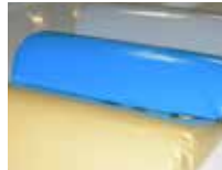
Color options on mattresses