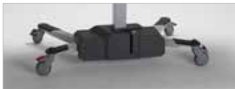
TR 2000 Hydraulic - Back of chassis