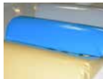
Color options on mattresses