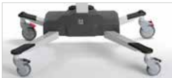
TR 2000 Hydraulic - High chassi and TR 3000 Battery operated - High chassi