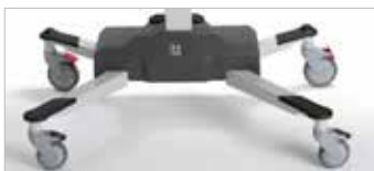
TR 2000 Hydraulic - High chassi and TR 3000 Battery operated - High chassi