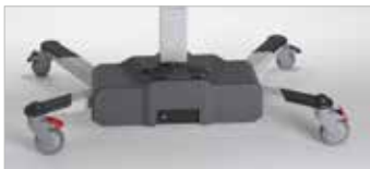
TR 3000 Battery operated - Back of chassis